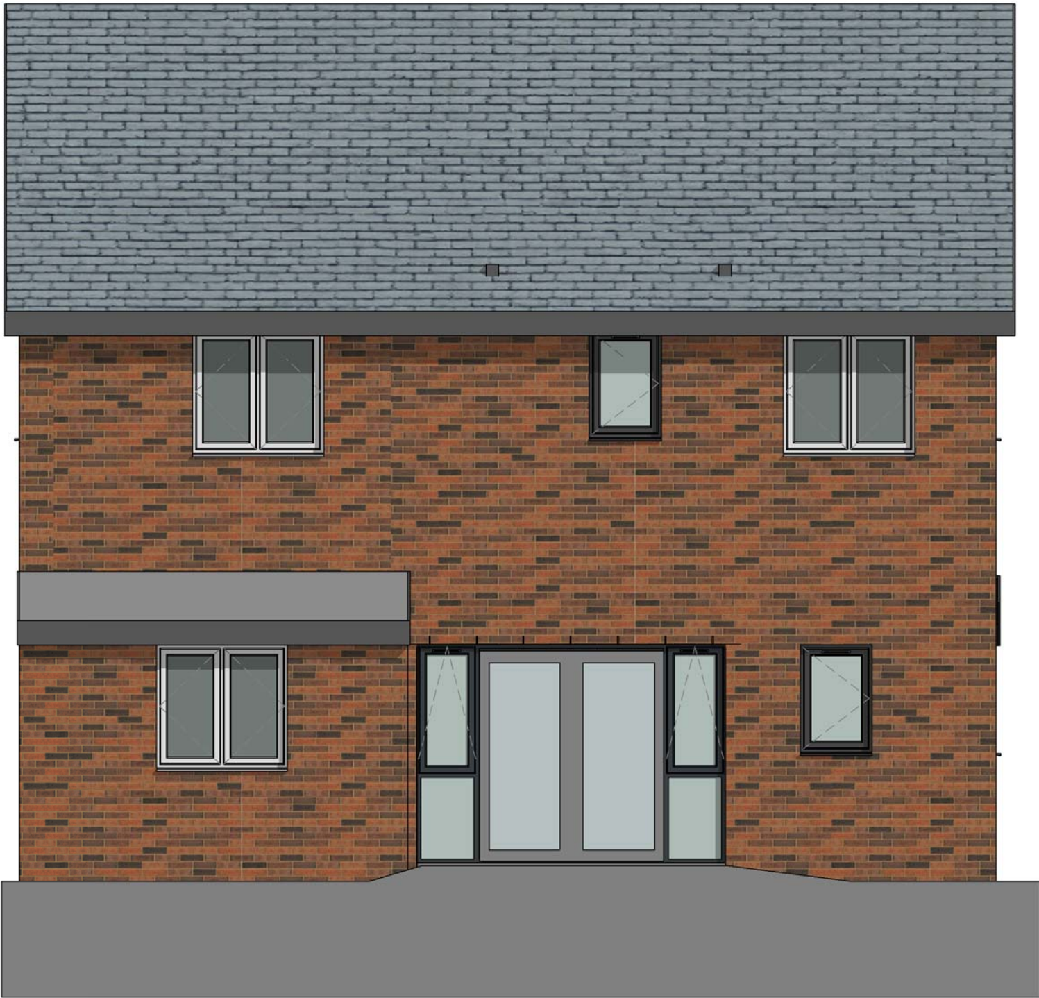
2 Rear Elevation 1 : 50