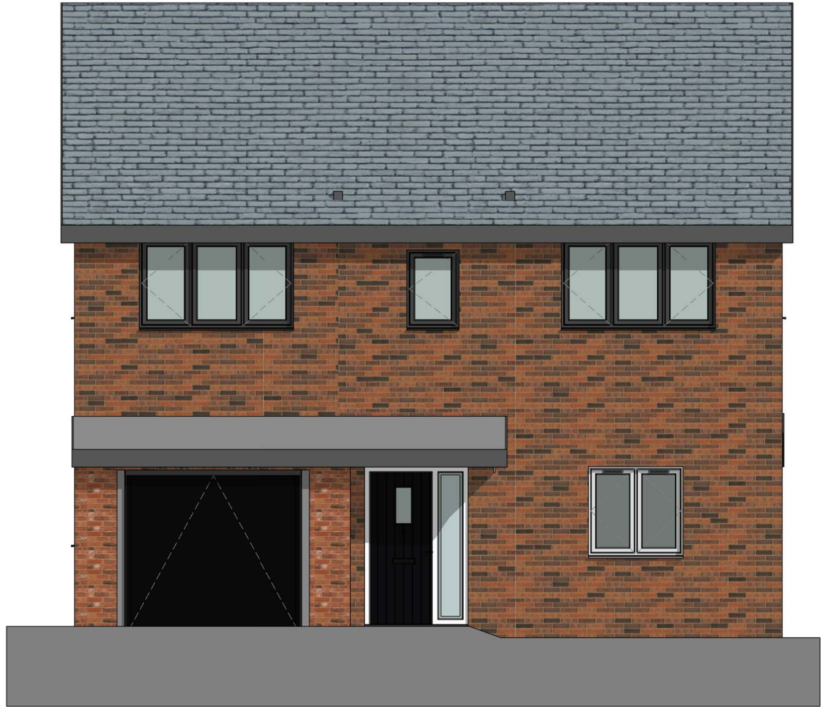
1 Front Elevation 1 : 50